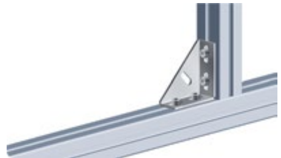
Stahlwinkel 30/80 Steel Connection Angle 30/80