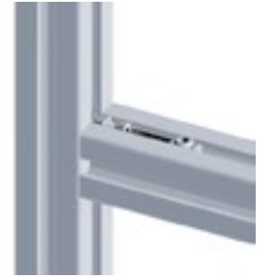
Fräsverbinder Profil 40 Milling Connector Profile 40