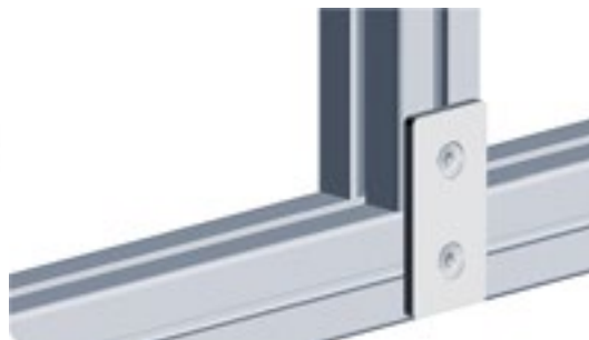
Verbindersplatte Connection Plate