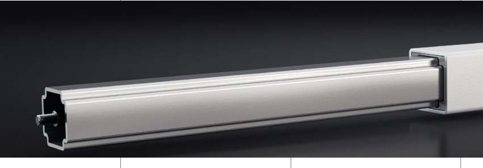
Table leg TU